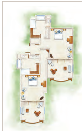
2-bedroom family suite