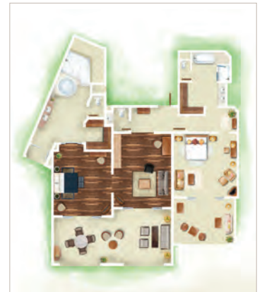
2-bedroom Senior Family Suite Beachfront