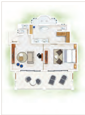
Paradis Suite Beachfront