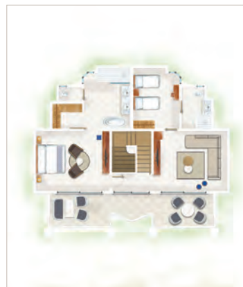
Paradis Luxury Family Suite Beachfront